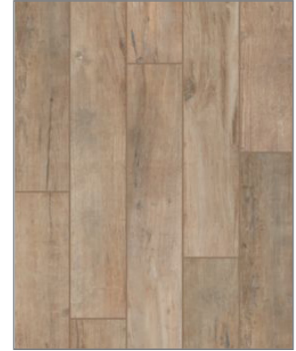
NATURAL DRIFTWOOD T859-MB04