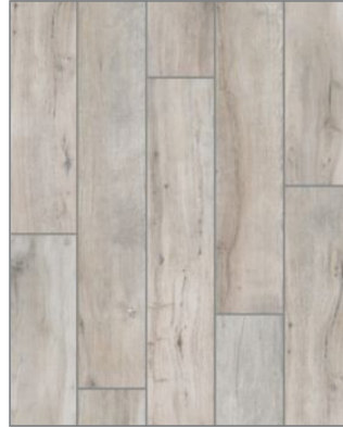
CHESAPEAKE GREY T859-MB02