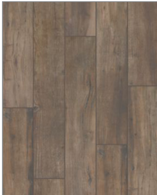
OZARK BROWN T859-MB05