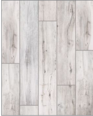
OCEANSIDE COTTAGE T859-MB01