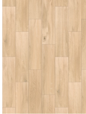
TUSCANY NATURAL T838-DV03