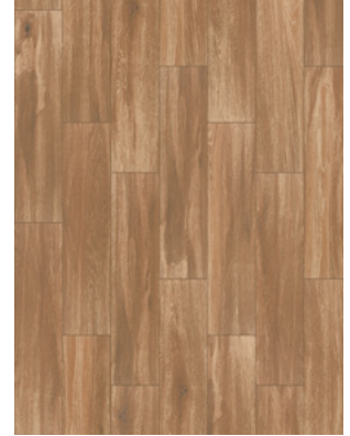
CINNAMON BARNWOOD T838-DV04