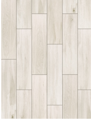
ANTIQUE WHITE T838-DV01