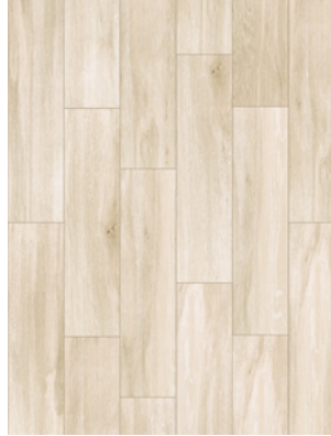
HARVEST WHEAT T838-DV02